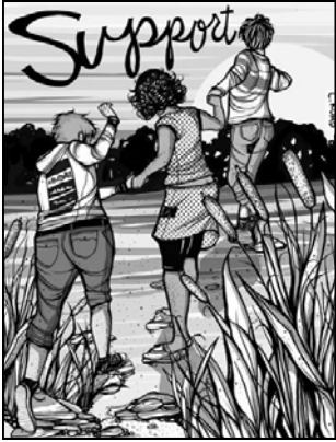
Art by Cristy C. Road, croadcore.org

Community-based responses to violence have a long history in many of our communities and networks, and have often been developed in contexts where we could not rely on the state or larger community to protect us from violence (such as Black communities in the slavery and post-slavery eras, immigrant communities, queer communities, and Indigenous communities). But these practices may not necessarily be called “community accountability” and can look very different depending on the circumstances.